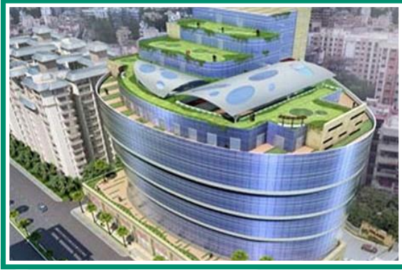
SOLARIS – COMMERCIAL BUILDING MUMBAI