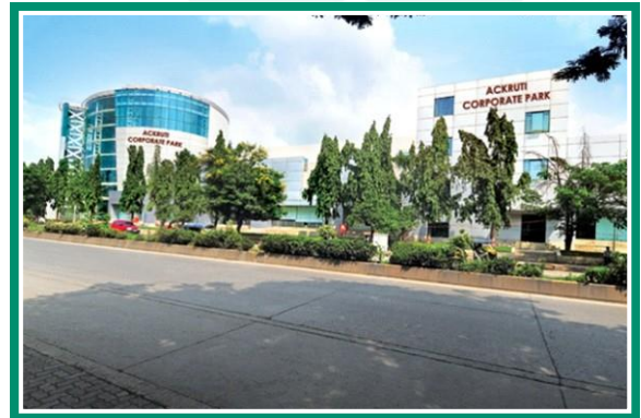
ACKRUTI STAR - OFFICE BUILDING, MUMBAI