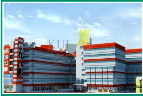
KK MARKET, PUNE