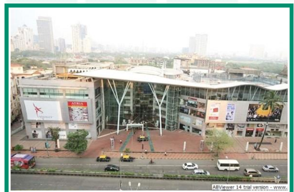
ATRIA MALL, WORLI