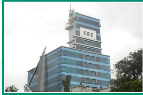
KUMAR BUSINESS CENTRE, PUNE