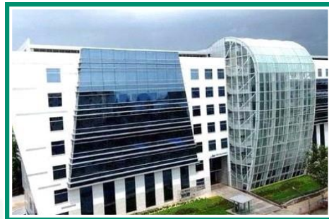
ACKRUTI CENTRE POINT – OFFICE BUILDING, MUMBAI