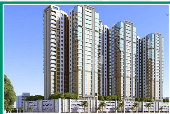
GREEN WOODS - RESIDENTIAL BUILDINGS, MUMBAI