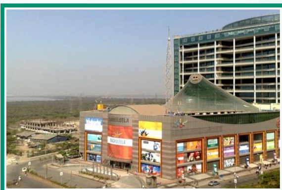
RAGHULEELA MALL – WADHWA GROUP