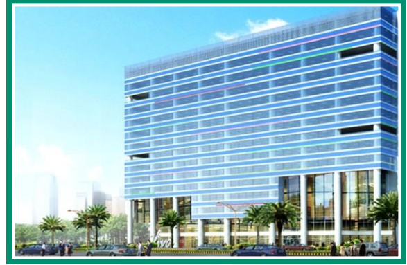
VIVA - COMMERCIAL BUILDING, MUMBAI