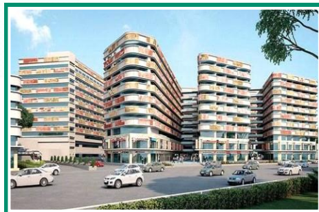
GEETAMANDIR BUS TERMINALS, GSRTC, GANDHINAGAR