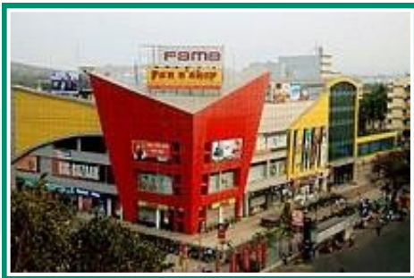
FUN N SHOP MALL, PUNE