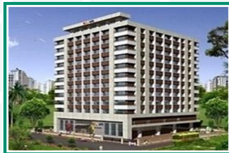
VIBGYOR SCHOOLS , MUMBAI