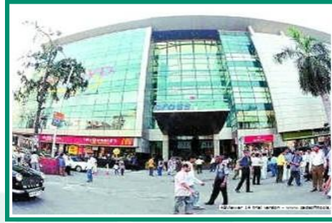
SUBURBIYA MALL, BANDRA