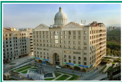
CELEBRUM IT PARK, PUNE