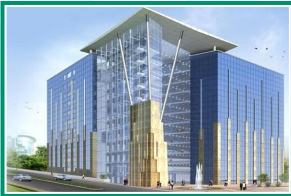
ACKRUTI STAR - OFFICE BUILDING, MUMBAI