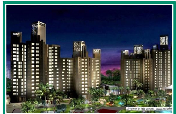
GARDENIA – RES.TOWER 14 NOS.