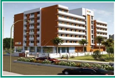
VIBGYOR SCHOOLS, PUNE & BANGALORE.